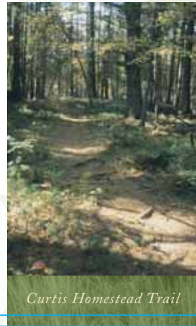
Curtis Homestead Trail

Woodlot Trail: 0.7 miles. This moderate trail passes through a mixed hardwood forest that was managed as the farm woodlot. The trail begins at Curtis Rock (a glacial erratic) and follows the eastern edge of the bog, providing several wonderful views with benches before looping back to an intersection with the Curtis Rock Trail.