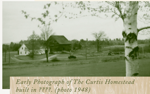
Early Photograph of The Curtis Homestead built in ????. (photo 1948)

Long before the Curtis family arrived in this part of Maine, long before there even was a Maine, this region was a prehistoric crossroads for native people who were traveling between the Kennebec and Androscoggin River watersheds. This area was likely used by Native American people for hunting, fishing and harvesting of native plants. These same resources brought the Curtis family and more recent residents of Leeds to this community.