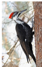
Pileated Woodpecker

Downy Woodpecker, Hairy Woodpecker, Pileated Woodpecker, Northern Flicker, Ruffed Grouse, Wild Turkey, Turkey Vulture, Broad-winged Hawk, Least Flycatcher, Swainson's Thrush, Eastern Phoebe, Brown Creeper, Winter Wren, Rose-breasted Grosbeak, Ovenbird, Black-and-White Warbler, Orange-crowned Warbler, Nashville Warbler, Palm Warbler, Common Yellowthroat, American Redstart, Northern Parula, Savannah Sparrow, Song Sparrow, Swamp Sparrow