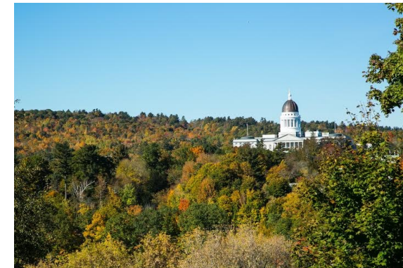
Maine State Capitol and Howard Hill