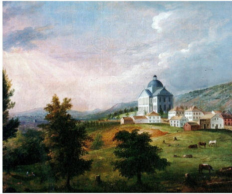
Charles Codman painting: Maine State House & Howard Hill, 1836

The City of Augusta's 164-acre Howard Hill Historical Park is a landmark of statewide significance. This iconic forested landscape, which has changed throughout geologic time and human history, is now permanently protected for the benefit of Maine's wildlife and people, and will forever serve as a natural backdrop to Maine's State House.