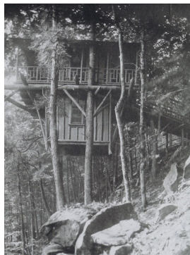
Ganneston Park tree house, circa.1920s; site of today's vista, granite bench, & plaque