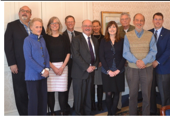
KLT donates Howard Hill to the City of Augusta March 22, 2017 ~ Kennebec Savings Bank