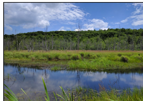
Rolling Dam Brook Preserve David Lawrence Parcel 17 acres, South Gardiner