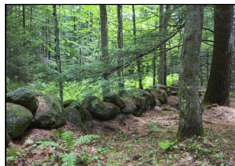
William Granville Besse Addition to the 65-acre Besse Historic Conservation Area.