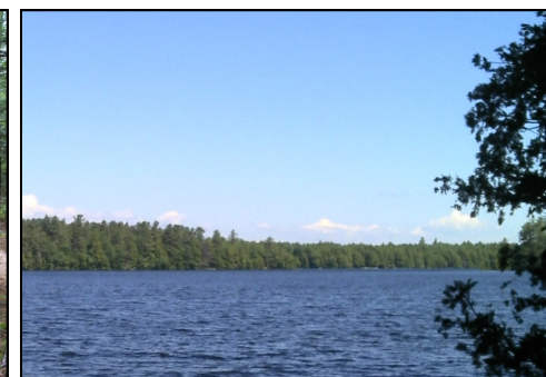
The Orestis-Crowley Addition to the 103-acre Echo Lake III Watershed Preserve, Fayette