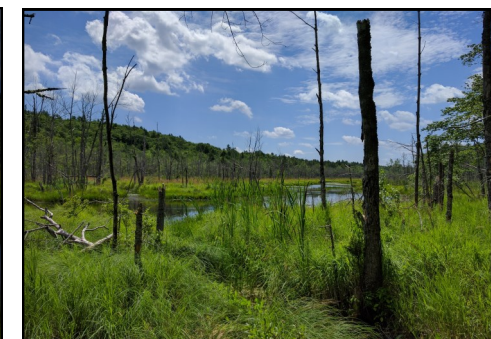
Joseph R. & Dorothy M. Donohoe Preserve 12-acre conservation easement South Gardiner