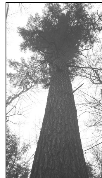
Orestis-Crowley Addition Echo Lake III Watershed Preserve, Fayette