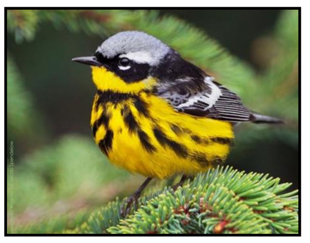
Magnolia Warbler

Regional Ecologist Maryland Department of Natural Resources Natural Heritage Program