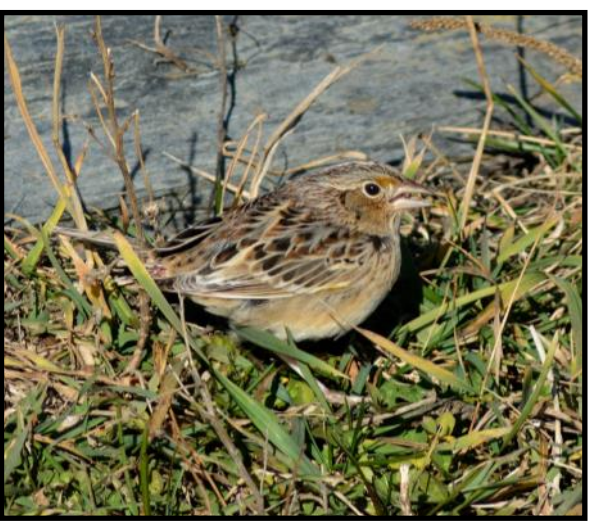
Grassshopper Sparrow; Photo Credit: Phil Downes

2017 LYCEUM Maine Birds from Katahdin to Merrymeeting Bay... and Everywhere Else in Between