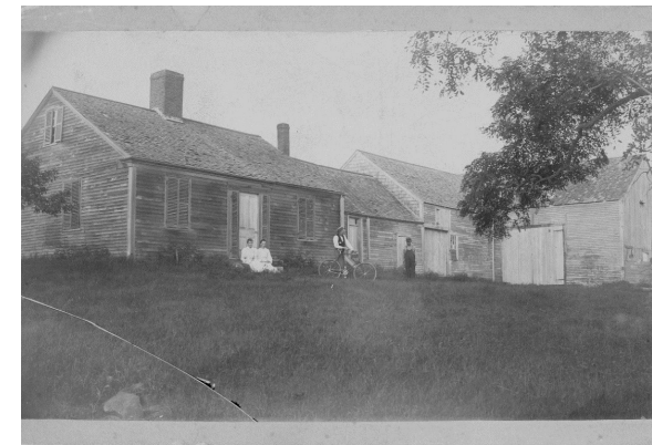
Samuel Hutchinson Homestead

Circa 1880's, Courtesy of Litchfield Historical Society.