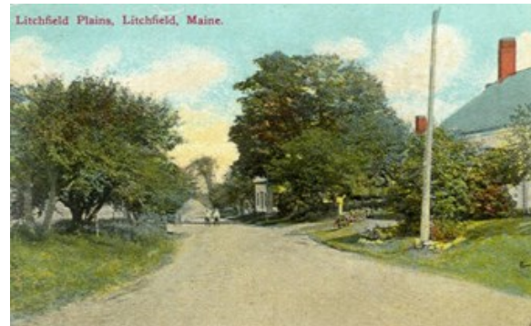
Circa 1910

Litchfield's Plains Village was south of the Hutchinson farm, and included the former site of the town house, the cattle pound, the fairgrounds, the Plains Baptist Church, the Plains cemetery, the Brick School, a post office, as many as three stores, a carriage shop and the mills on Potter's and Spring Brooks.