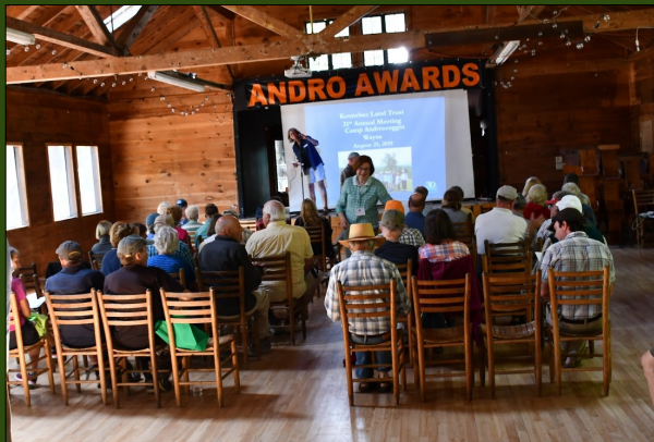
2019 Meeting at Camp Androscoggin

Printed on 30% post-consumer recycled paper