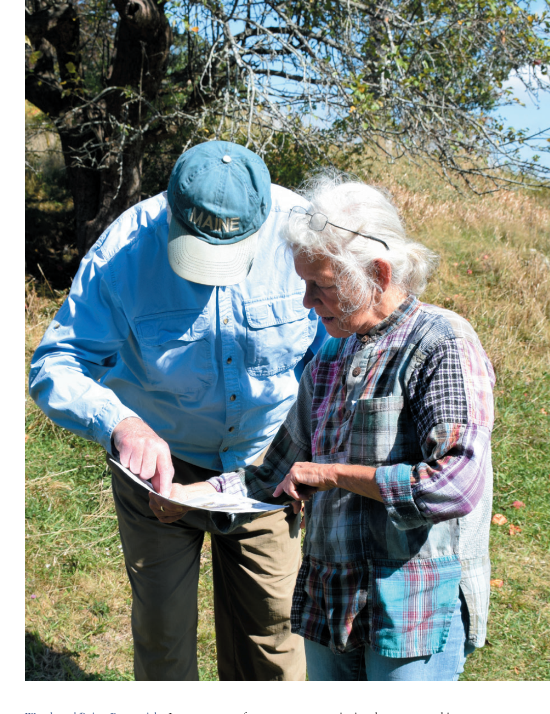
Woodward Point, Brunswick Long-term care for easement properties involves a partnership between the landowner and volunteers or staff from the land trust holding the easement.

While the easement is a popular and versatile conservation tool, it may not be the best choice for all landowners. Some lands lack sufficient conservation significance to merit protection with an easement. Other lands, such as those that receive extensive public use, might be best owned and managed by a public agency or private land trust .