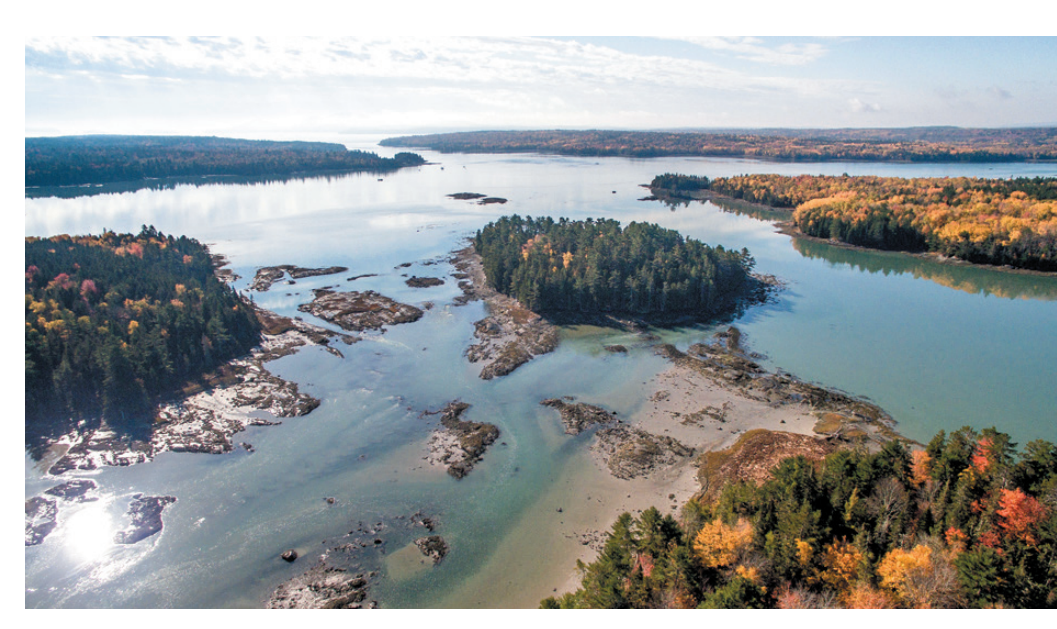
Hills Island, Upper Frenchman Bay By offering to sell to MCHT at a bargain price, Gale McCullough and Stu Gillam helped protect additional properties and fuel a collaborative effort among three land trusts that conserved the area around the island and a tidal estuary.

A bargain sale, where property is conveyed at less than its fair market value, can help increase the chance that a conservation organization or government agency can purchase the land. It is also a great way for the landowner to contribute to the project's success. The landowner and purchasing organization negotiate a mutually agreeable price below the fair market value. While a bargain sale may produce a smaller financial return than a sale at fair market value, the loss can be somewhat offset by tax savings. The difference between the land's appraised market value and its bargain sale price is considered a tax-deductible charitable donation. For any gift of property valued at over $5,000, the fair market value must be substantiated by a qualified appraisal commissioned by the landowner, to receive a tax deduction.