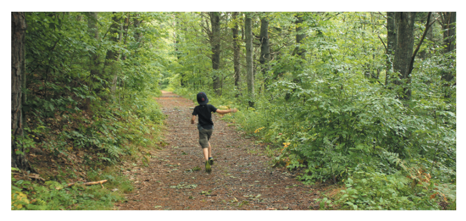
Dodge Point, Newcastle A local land trust or a statewide conservation organization can help you review options and locate the resources needed to protect your land for future generations.

As you read through the following chapters, you will notice that some words appear in italics. These terms, some of which may not be familiar, are defined in the Glossary on page 35 (Appendix D).