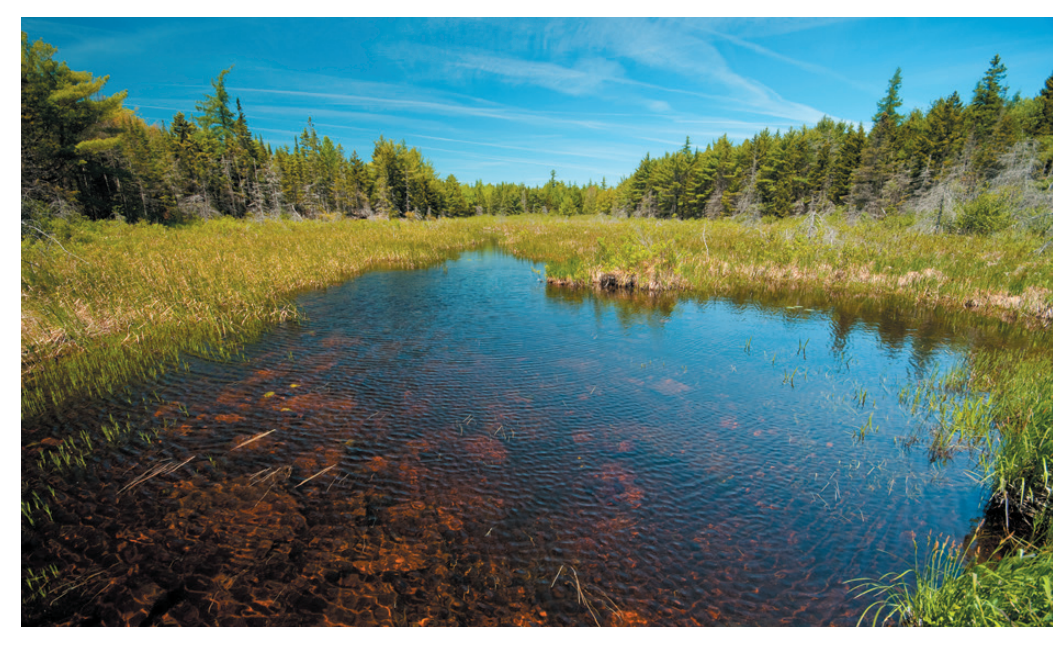
Kittredge Brook, Mount Desert Island Donating land is an excellent option for landowners who want to preserve the scenic and ecological qualities of their land for future generations.

Outright donations of conservation land offer several advantages. They are relatively simple transactions that provide maximum income and estate tax benefits (while avoiding capital gains tax), and they transfer ownership and management responsibilities to a nonprofit organization or government entity. Most important, they can ensure the land's public benefits are permanently conserved.