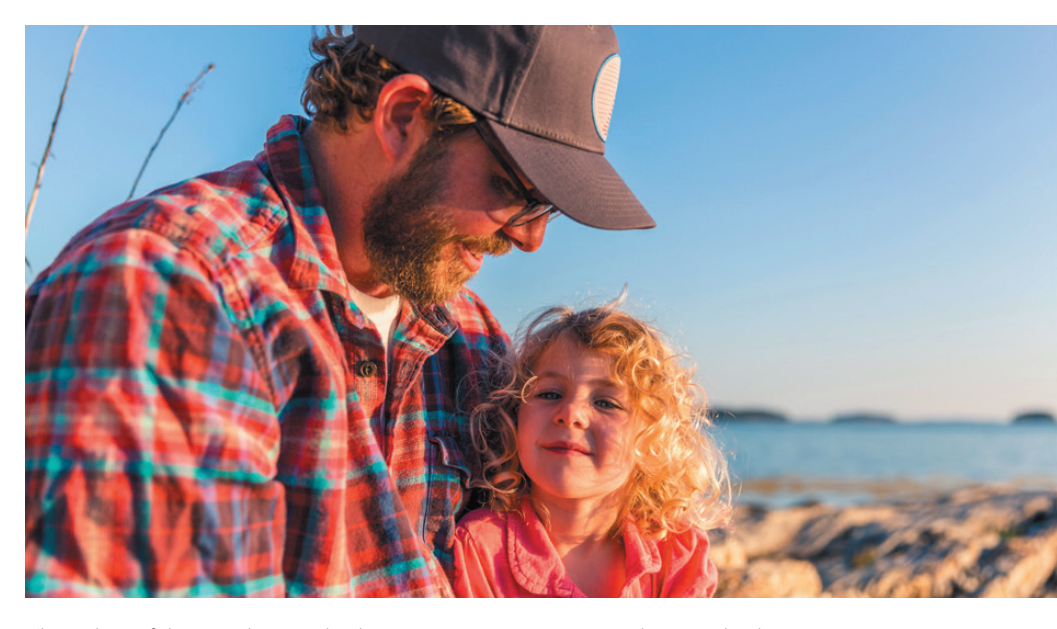
Through careful estate planning, landowners can minimize taxes and ensure that heirs can continue to enjoy their family's land.

The Taxpayer's Relief Act of 1997 created a new federal estate tax program, Internal Revenue Code Section 2031(c), to help families keep protected land. If a person dies owning land that has been in the family at least three years and is subject to a qualified conservation easement (placed by the owner prior to his or her demise, the executor , or the