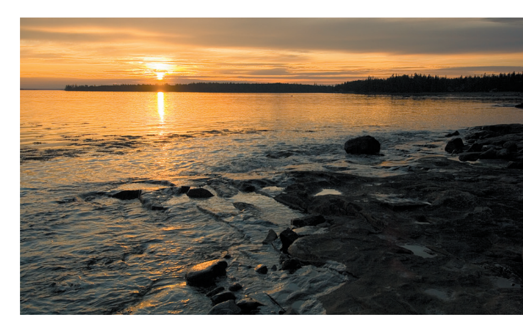
Mount Desert Island, Bernard sunrise Conservation easements enable landowners to permanently protect their cherished properties while still retaining ownership.

When you own land, you hold many rights associated with it such as the right to harvest timber, build structures, extract minerals or farm — subject to zoning and other laws. In granting a conservation easement, you voluntarily limit or relinquish some of your rights on that land. As part of the process, you identify an entity as the easement holder. It is the holder's job to monitor and enforce the limitations and restrictions you have identified in the easement. The prospective easement holder (generally a nonprofit land trust or government agency) works with you to tailor an easement that protects the land's natural and cultural values while meeting your land use goals.