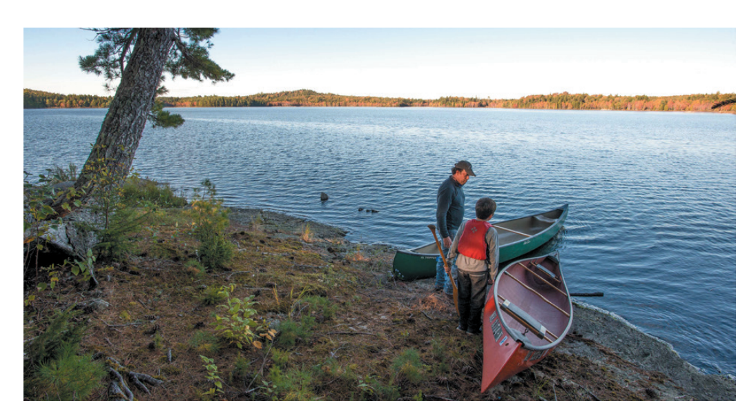
Rocky Lake Preserve, Whiting Sound conservation planning can reduce taxes, helping to keep land in family ownership over the generations.

Federal estate tax law in 2020 exempts the first $11,580,000 worth of combined gross assets and prior taxable gifts per individual (this figure changes frequently). The federal estate tax — levied at rates between 18 and 40 percent — is imposed on land's fair market value. If your land has significant development potential that you never intend to use, removing that value from the land before it passes to family could help minimize the tax burden for your heirs.