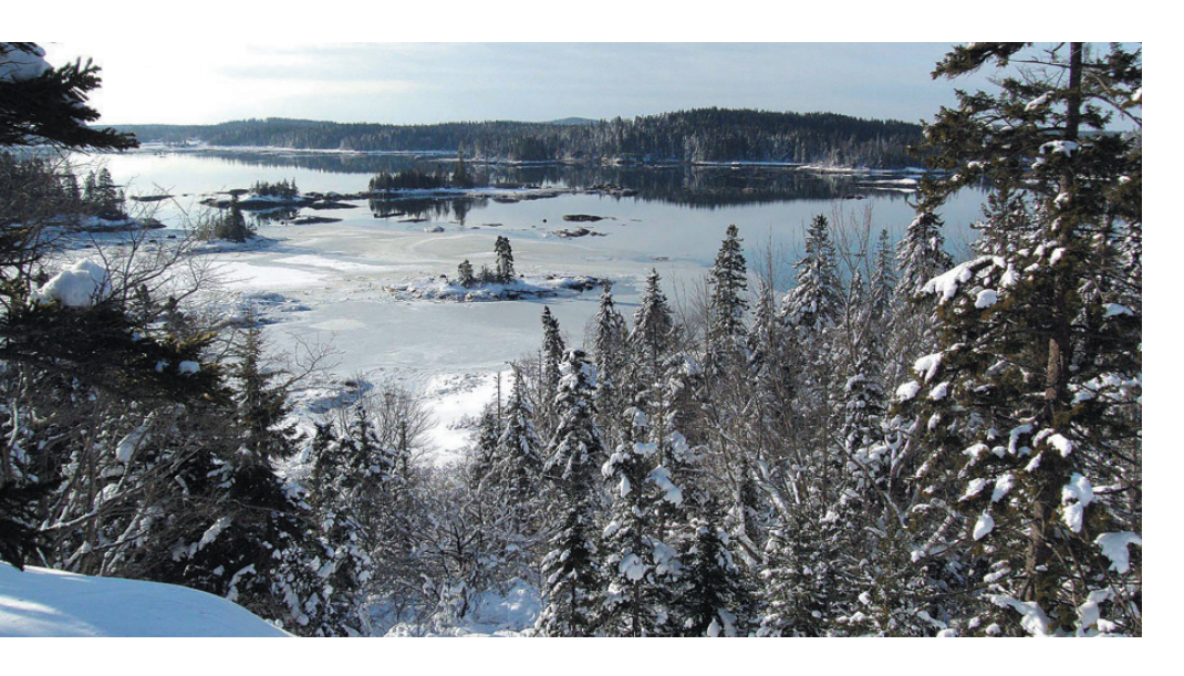
The Basin, Vinalhaven

To be eligible for any MaineCare benefit, applicants must meet limits for income and assets that are typically quite low but vary depending on the type of care requested. However, not all income and assets are counted toward eligibility limits. Real property that is exempt includes