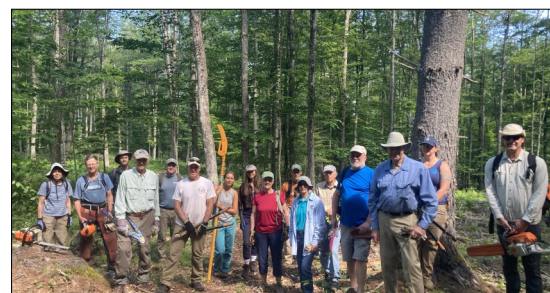
Oak Hill Conservation Area trail volunteers