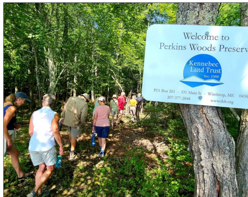
Perkins Woods Walk