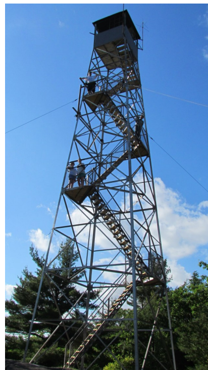
Historic Mt. Pisgah Fire Tower

2022: Hales Pond Woodland Preserve donated to KLT