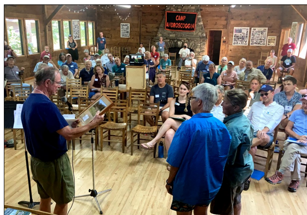
2022 Annual Meeting at Camp Androskoggin

Tyler Conservation Area, Oak Hill Conservation Area, North Acres Conservation Area, Vassalboro Wildlife Habitat Addition, Mt. Pisgah Plourde Addition, Hales Brook Addition