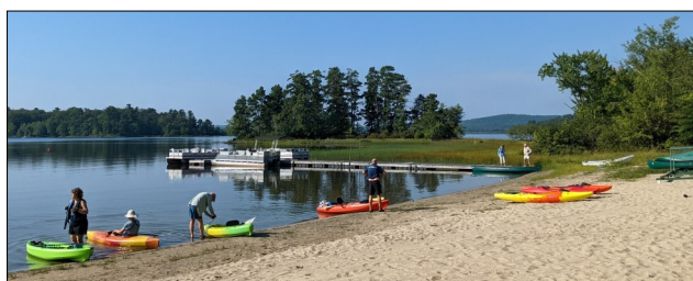
Paddlers leaving for Norris Island