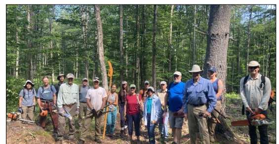
Oak Hill Conservation Area trail volunteers