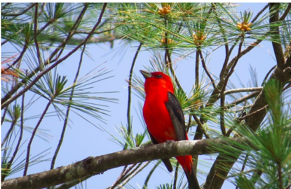
Scarlet Tanager ~ Glenn Hodgkins