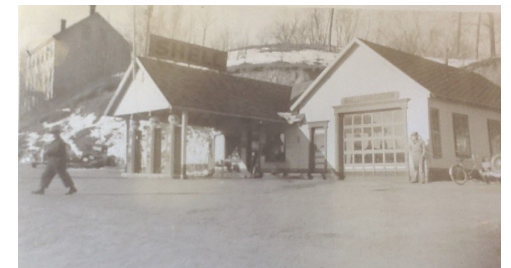
Wakefield Service Station, 1941